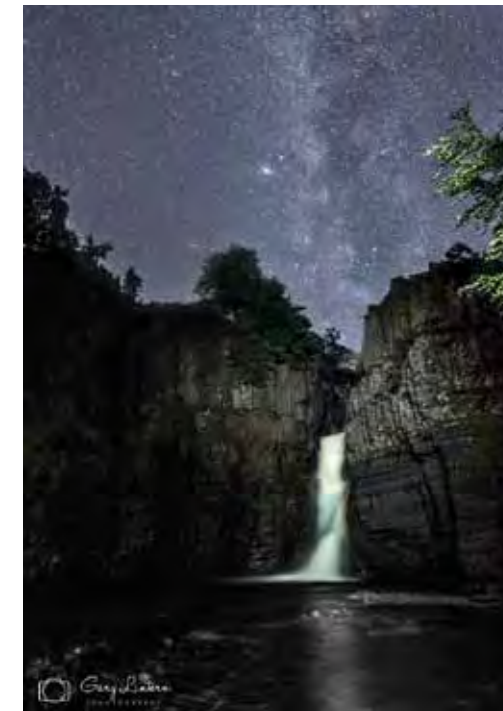
The Milky Way over High Force Waterfall.

The North Pennines Area of Outstanding Natural Beauty (AONB) and UNESCO Global Geopark has some of the darkest skies in England. This is one of the features that makes the area particularly special, alongside its internationally acclaimed geological heritage, unique combination of rare flora and fauna, beautiful landscapes and fascinating cultural history. The AONB Partnership (which manages the Geopark) has organized a successful Stargazing Festival annually since 2017, with the support of other organizations and partners. The aim is to inspire people to stop and take notice of these fantastic dark skies, to learn more about the world and the universe we live in, and above all to enjoy the experience. The festival is held in October, to coincide with a school holiday week and