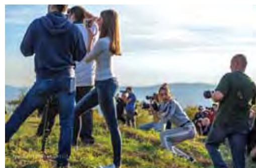
Amateur photographers in action.