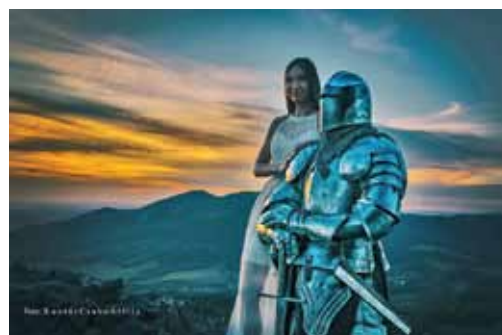
A lady and her knight modelled during sunset photography in the castle in Fülek/Fil'akovo.