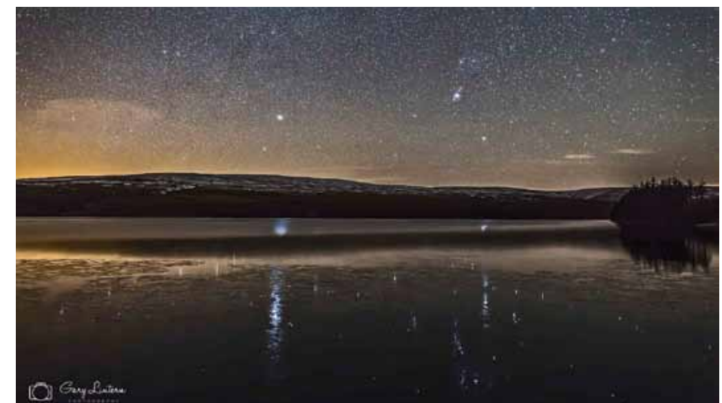
The night sky at Burnhope Reservoir.